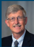
Francis Collins, M.D., Ph.D.

Director, National Institutes of Health (NIH)